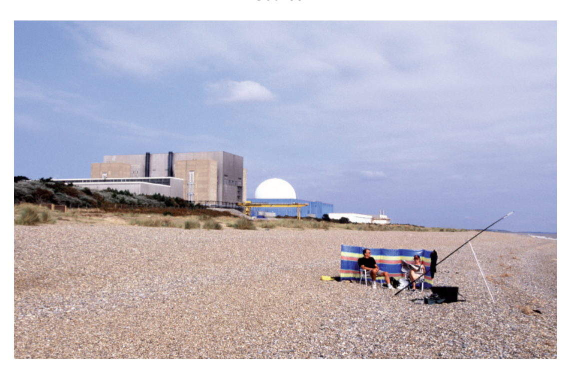
A nuclear power station, Sizewell, Suffolk