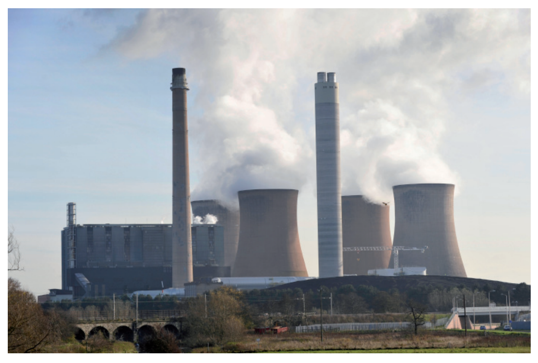
A coal-fired power station, Rugeley, Staffordshire