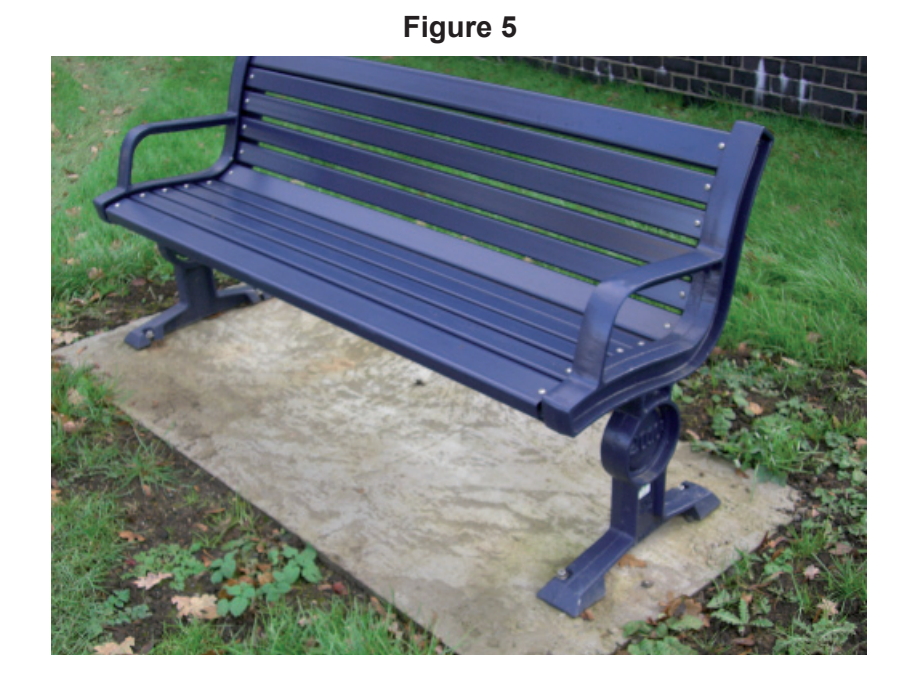
Figures 5–7 should be used to answer Question 5.