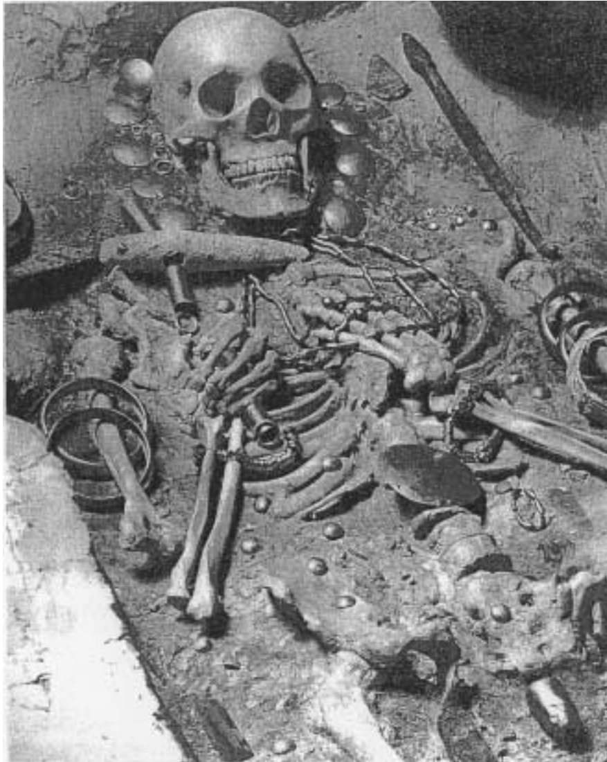
Figure 1 ‘The grave of the Golden Penis’: Varna cemetery, Bulgaria. c4000 BC